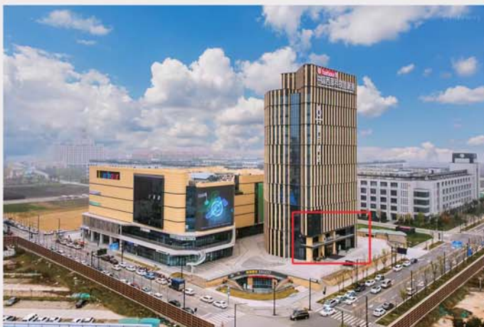
蔓兰酒店 Hotel MoMc