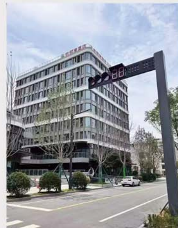
悦邻港酒店 Hotel Yuelinggang